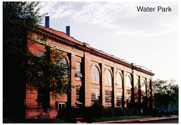
Southern Heights Church