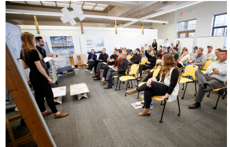
Student finalists present their design studio projects to an external jury of nationally recognized leading architects.