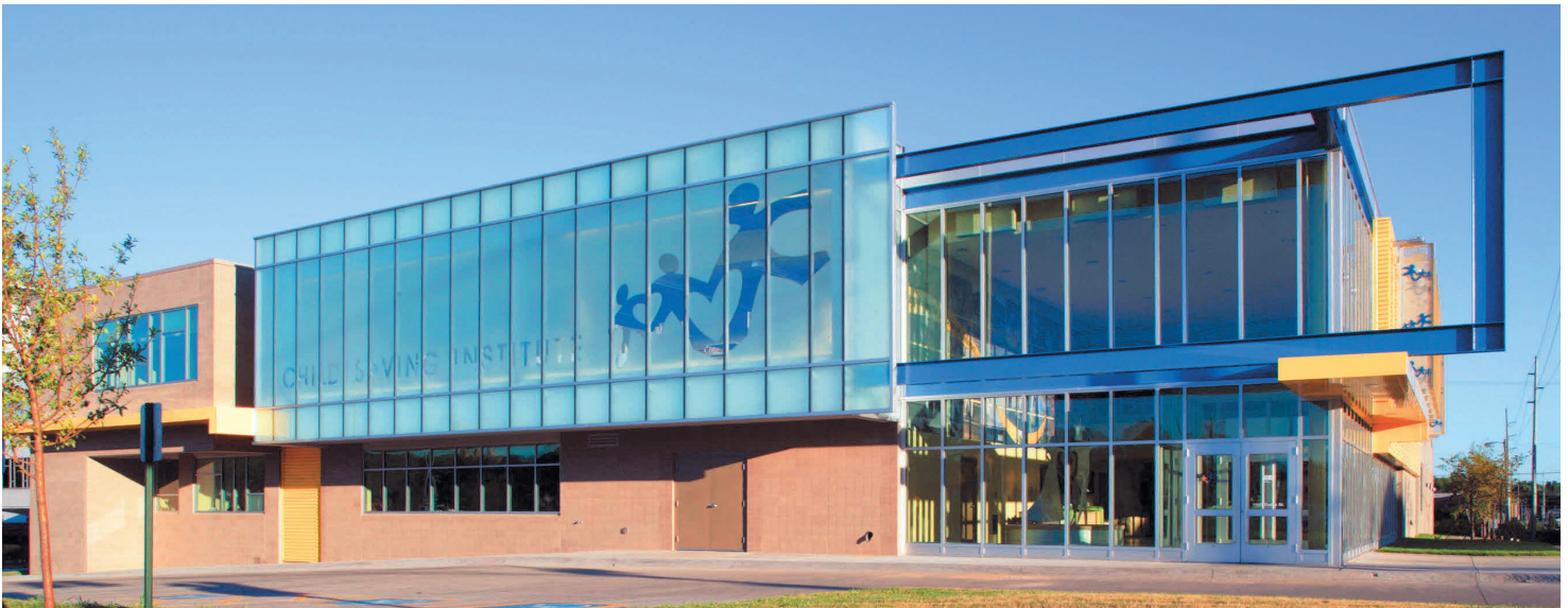
Child Saving Institute, RDG Planning & Design