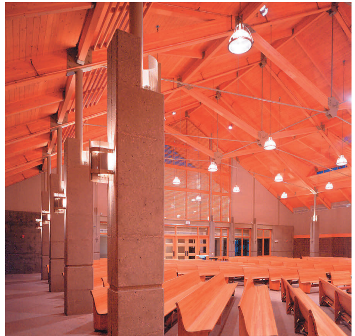
St. Therese - Sioux Falls, AIA National Award