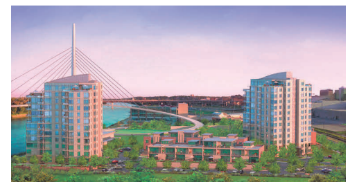
RIVER FRONT PLACE OMAHA, NE.