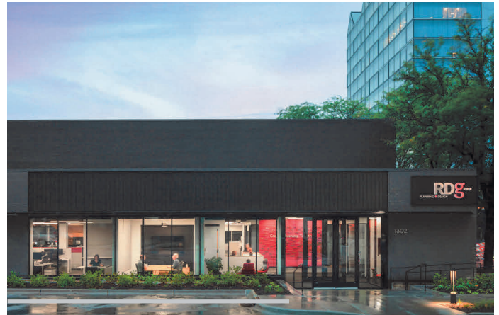
RDG Planning & Design: Committed to support downtown.