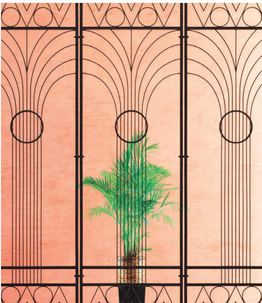
DETAIL AT PRINCE OF PEACE ENTRY