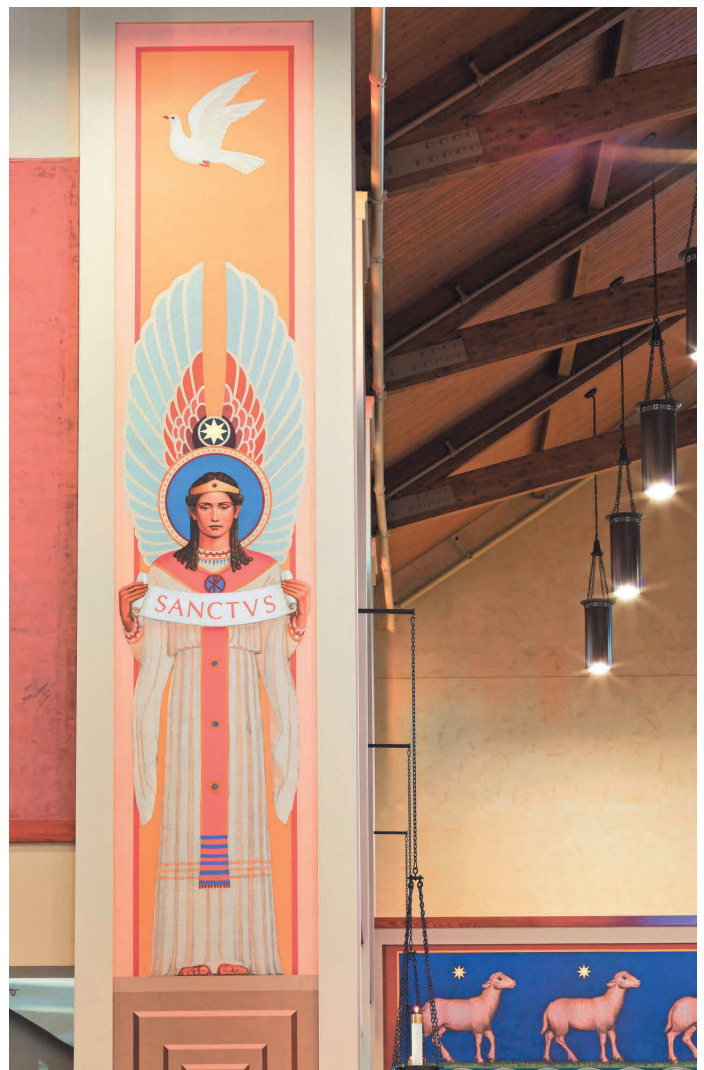
Prince of Peace Catholic Church, Kearney NE. Historic ties to faith and Nebraska