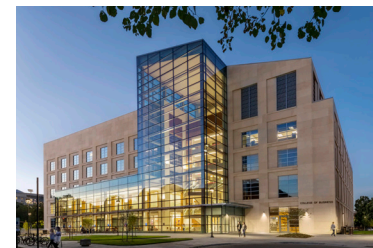
UNL College of Business | APMA/RAMSA