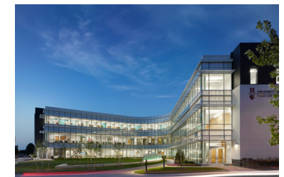
UNL College of Nursing | APMA/HGA