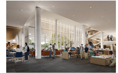
Omaha Central Library | APMA/HDR