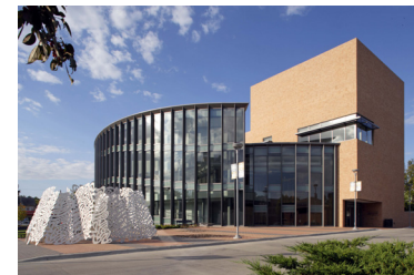
International Quilt Museum | APMA/RAMSA