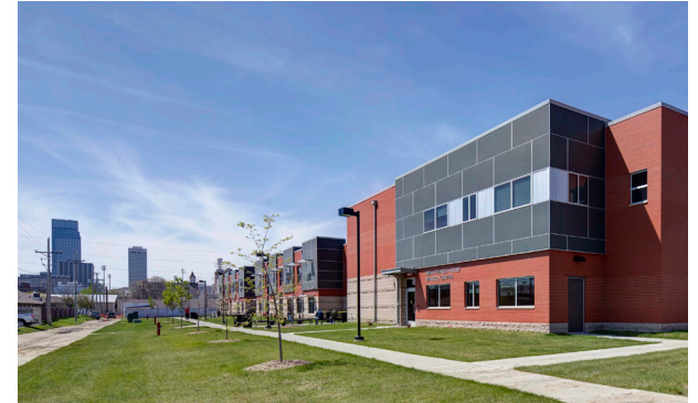
Siena Francis Human Services Campus