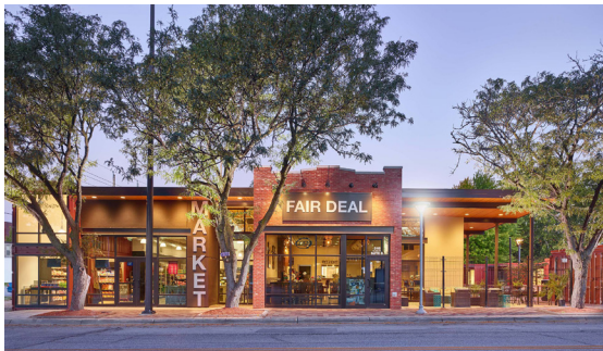
The Fair Deal Marketplace

Some of our first work was preservation and adaptive reuse projects. The conversion of the Roseland Theater on South 24th Street, exhibits our commitment and unique approach to community development. In 1987 the building was slated for demolition, but had been identified by the city as an important building to save. Our founders proactively worked to develop a concept that would qualify for historic tax credits (an early use of them in our city) and then recruited a developer to make the project happen.