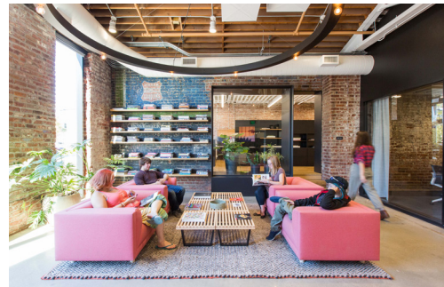
The Union for Contemporary Art