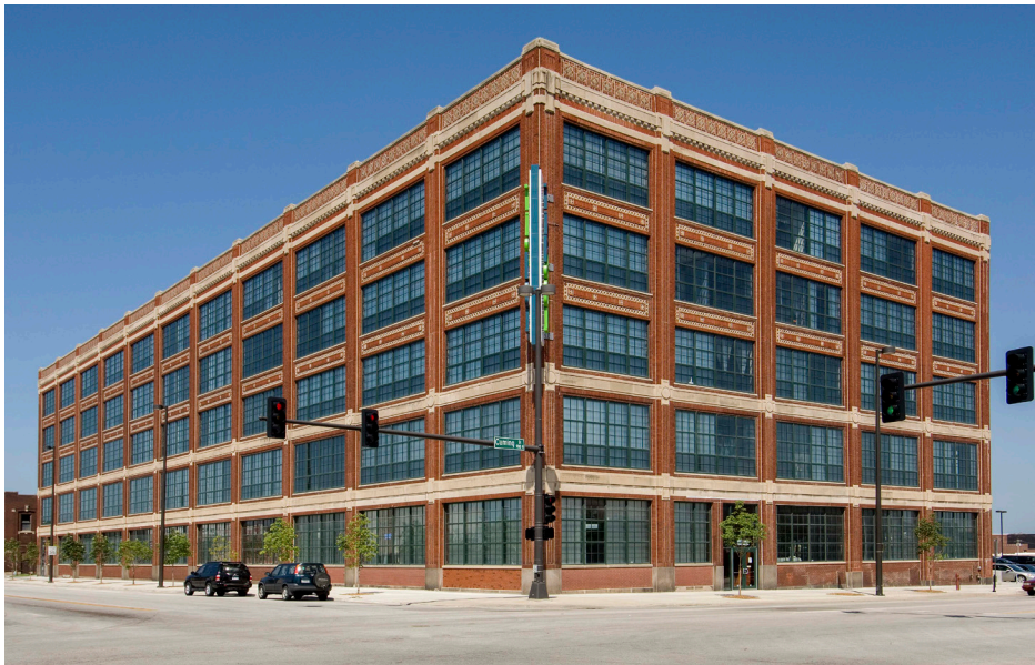
APMA Omaha Office

Our office is an open studio space and encourages collaboration and idea sharing between teams. At the heart of this collaborative spirit are our founders and firm leadership who play a vital role in supporting design teams on each assignment.