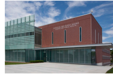
UNMC College of Public Health | APMA/BNIM

Giving back has always been at the core of our practice. We believe design is an act of optimism and our approach to pro-bono work reflects that. Over our firm's 37 year history, we have consistently worked with non-profit organizations that serve at-risk communities. Many of these endeavors are passion projects for our team members. Whether it's an orphanage in Ethiopia or programming for a community center that serves Omaha's growing South Sudanese community, our current portfolio of work is filled with projects that come from the heart.