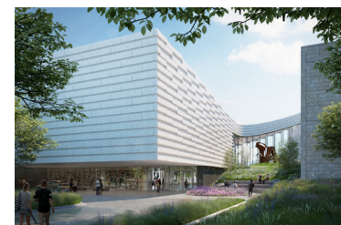
Joslyn