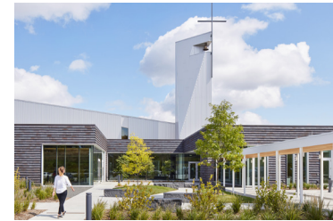
Countryside Community Church | APMA/HGA