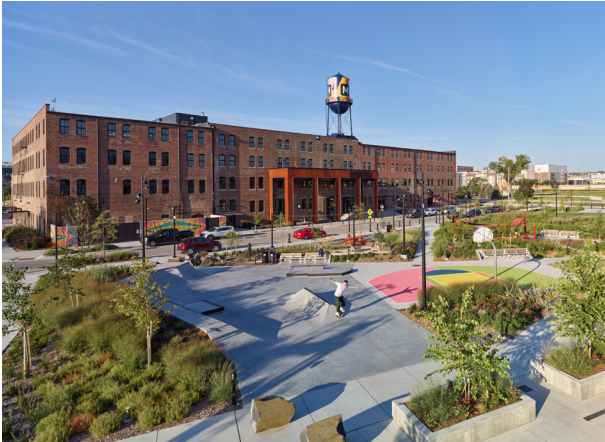
The Ashton Building + Millwork Commons Park