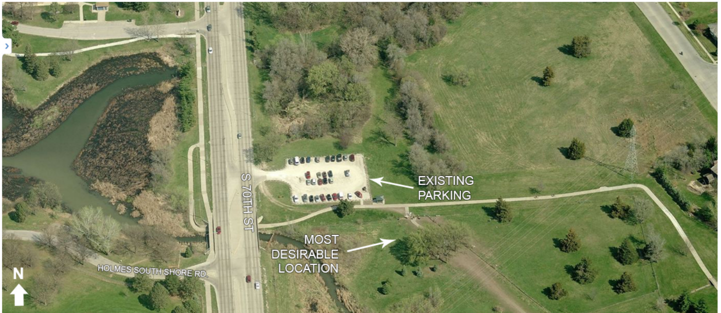
SITE ORIENTATION MAP 1: