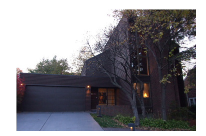
3449 West Pershing Road