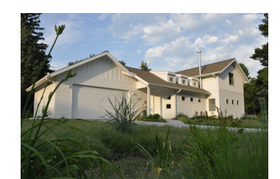
4005 Orchard Street